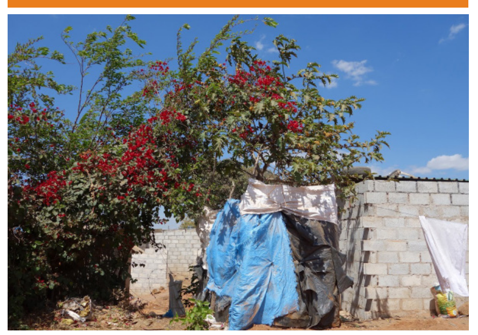
Typical sanitation in Bauleni, Lusaka